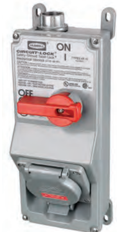
HBLMITL - For use with Watertight Safety-Shroud receptacles, see page B-39.